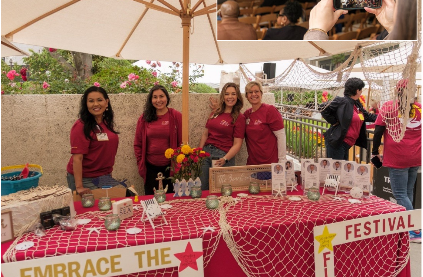
Annual Festival of Life