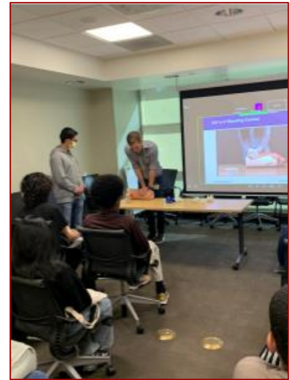
2024 Healthcare Horizons Day

USC Norris Cancer Hospital provides the following resources to the community: