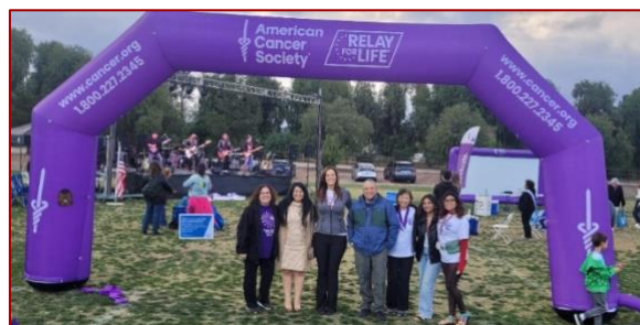
2024 Santa Clarita Relay for Life