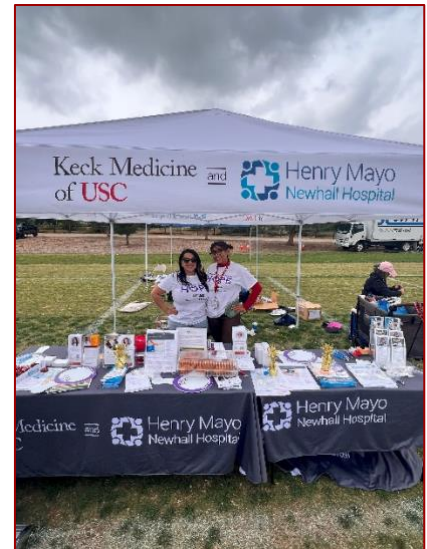
2024 Santa Clarita Relay for Life