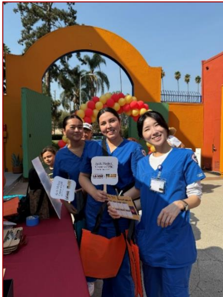
2 nd Annual Community Health Fair hosted by the La Voz employee resource group (ERG), in celebration of Latinx Heritage Month – Fall 2024

The complete CHNA report can be accessed at Community Benefit and Outreach - Keck Medicine of USC . Keck Medicine welcomes feedback on the Community Health Needs Assessment and Implementation Strategy. Feedback can be sent to: BenefitandOutreach@med.usc.edu .