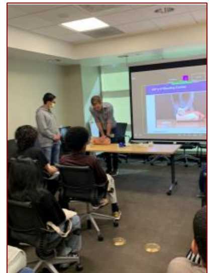
2024 Health Care Horizons Day