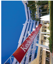
Keck Hospital of USC (MCC)