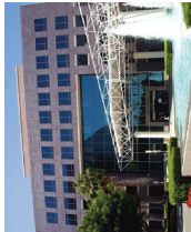
USC Healthcare Center (MCC)