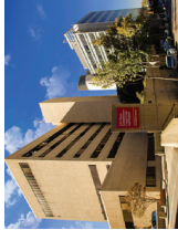
USC Norris Comprehensive Cancer Center and Hospital (NOR)

Electric vehicles operate Monday through Friday, 8 a.m. – 5 p.m. They run every 10 minutes between USC Norris Cancer Hospital, HC-4, Keck Hospital, HC-1 and HC-2. They also operate available on-call from Keck Hospital, Gold Lobby (323) 442-9995, Cardinal Lobby (323) 442-9987, from USC Norris (323) 865-9796.