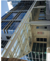
USC Healthcare Center 2 (MCC)